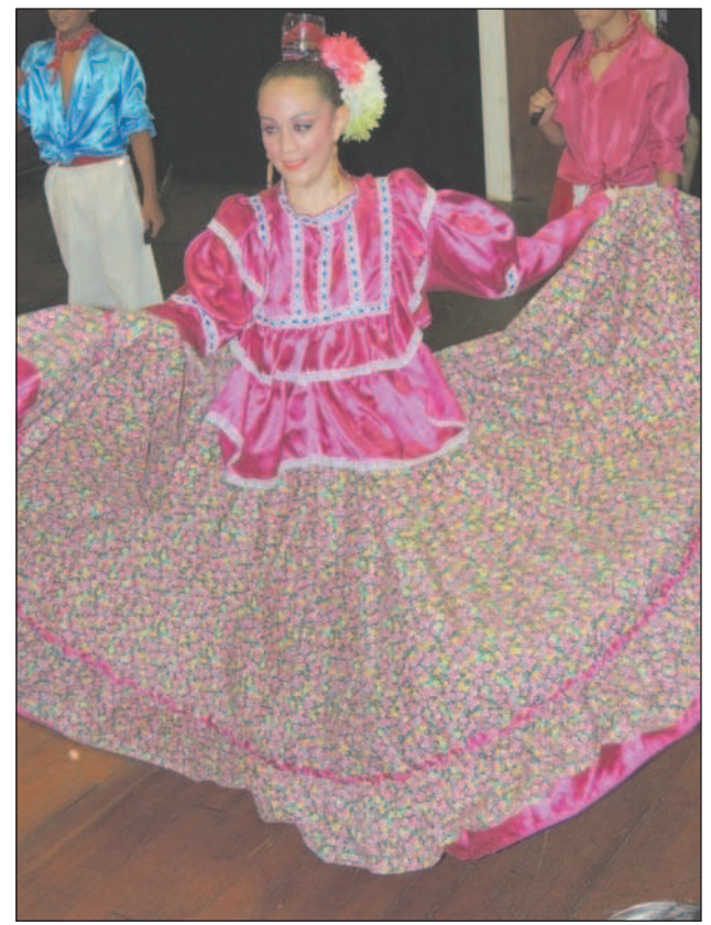
Dancers with Ballet Tlanese thrilled an appreciative crowd at the Opal Center.