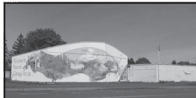
711 HWY 99 Currently used as the Moose Lodge. The property consists of two buildings connected by a parting wall. North lot is 16,550 sqft with the building being 4,700 +/- the south lot is 17,424 sqft with the building being 4,200 plus some second story. MLS#14113226 PRICE$295,000