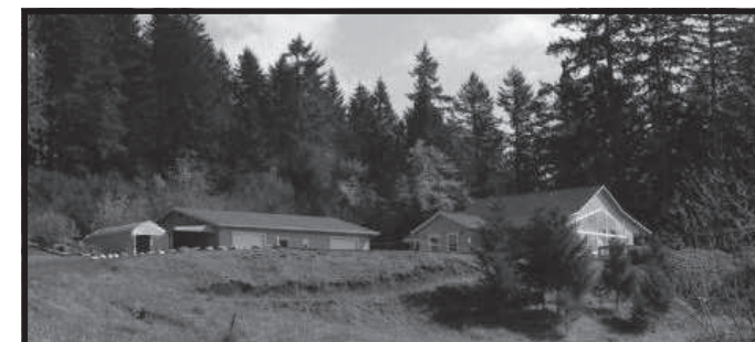
2225 E MADISON AVE Enjoy the sunsets with panoramic views of the valley & coast range. Spacious 2160 sqft. 3 BD, 2.5 bath home with lots of view windows & large deck. Internet connections in every room. Oversized 30'x50' 2 car garage, shop/hobby room with RV parking/sewer hookup. Room to split off a building lot. Two additional building lots are also for sale. MLS#15654489 PRICE$349,000

RESIDENTIAL • LAND • COMMERCIAL • FARMS • TIMBER