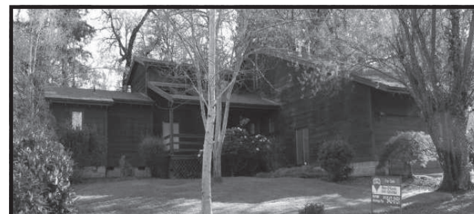
2227 W HARRISON AVE spacious contemporary custom home with new interior paint and carpet. Located in city limits on .32 ac. The private back yard is wooded and brings the home a warm, rural country feel. This unique home has vaulted ceilings, skylights, a large 2 car garage, forced air gas heat and air conditioning. The sun room is a lovely place to grow all your plants. Includes a 1 year home warranty. MLS#14019506 PRICE$264,900