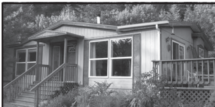
39541 LOWER BRICE CREEK RD One look and you'll be sold! This 30 acres has much to offer. Timber, pasture, barn w/ 2stalls, outbuildings and river frontage. Private, quiet large 3/2 home with magnificent views, property backs up to BLM. 3 miles to National Forest, fishing, waterfalls and hiking. MLS#15645807 PRICE$339,500