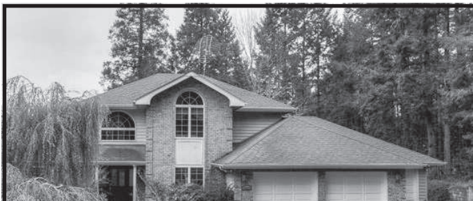
32623 GLAISYER HILL RD Gorgeous Custom home with views of Cottage Grove Lake. 5+ private acres with 32X48 large shop. 4 Bedroom, 4 Bathroom with full finished daylight basement. So many extras, 1st class home. Light filled with beautiful views. MLS#15290534 PRICE$474,900