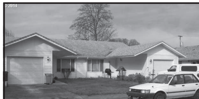
175 N LANE ST Well built and well kept duplex. Easy care vinyl siding, not far from downtown and shopping. Good renting history with low maintenance. MLS#14548306 PRICE$172,900