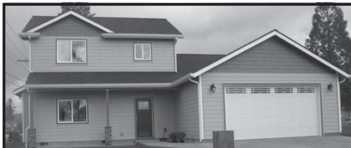
624 HARDING PL Be the first one to live in this brand new custom home. A home that you will be proud to own. Move in ready. Tons of room and all done to perfection. This 2-story home has great separation of space, 1st floor master with vaulted ceiling and a sliding door leading to the patio. The home offers the great room concept, custom cabinets, patio off the dining room and a fireplace. The 2nd story has additional 2 bedroom & 1 bath and a family room. MLS#15256685 PRICE$239,900