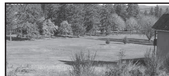
980 HOLLY AVE Good price for a great golf course lot! All utilities. Wonderful neighborhood & Hidden Valley Golf course views abound. No subordination for building. MLS#9089781 PRICE$49,500