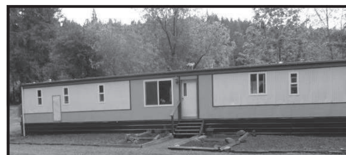
2289 BENNETT CREEK RD Newly updated 2 bedroom 2bath MFH on 1+ acres with some timber! Large vinyl windows. New Carpet and Lament flooring, new 1/2 hp with 82 gal tank, fresh water & black water plumbing. New septic system 2,000 gal tank with pump. Newer 10X20 shed with double doors. New skirting and deck. New range, electric water heater and toilets. MLS#15387321 PRICE$129,500