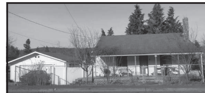
495 S 16TH ST Ranch style home with covered front porch. Comfortable home with wood laminate flooring in most rooms. Large master suite. Second BR no longer has exterior window after remodel. Easy care yard with apple, plum & cherry trees, raspberries & blueberries. Detached 2 car garage. Not far from shopping, park & freeway access. MLS#15092765 PRICE$137,500