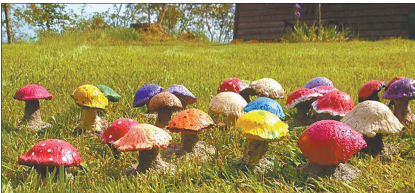
Hypertufa (cement) mushrooms bloom in Deanne Connon's yard.

Community snapshots from community members