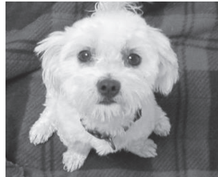
BOCHETTO DAY SPA 104 S HWY 99, 541-767-1616