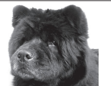
COTTAGE GROVE VET CLINIC 541-942-9181