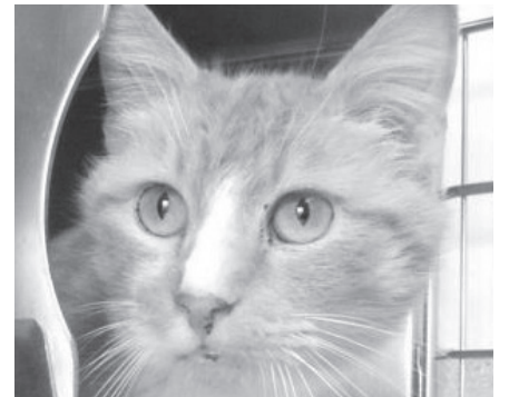
COTTAGE GROVE SENTINEL 541-942-3325