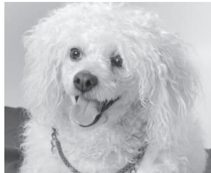
ERIKSEN GRAPHICS 541-915-0883