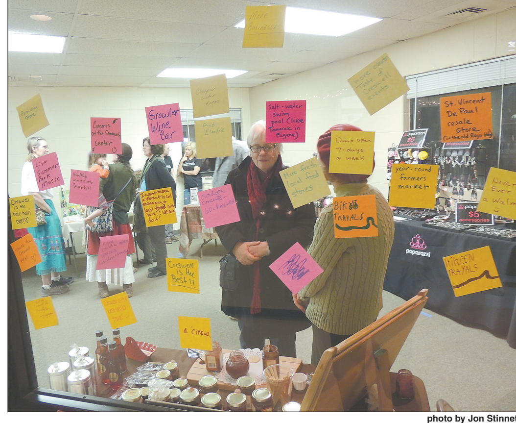
Taste of Creswell offered visitors a chance to add to a wish list for the community.