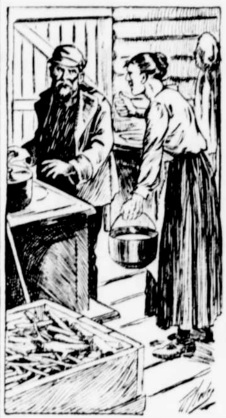
"D'you Turn Them Calves Out into the Corral?"

"Oh, but I'll have to go anyway," the girl interrupted. "Mawmie can't be there alone, she'd worry herself to death if I didn't show up by dark."