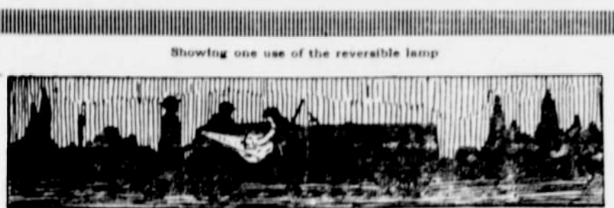
Showing one use of the reversible lamp