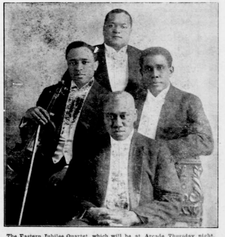
The Eastern Jubilee Quartet, which will be at Arcade Thursday night.