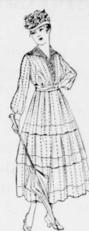
A Simple Frock of Voile McCall Pattern No. 7057, one of the many new designs for April

Beautiful fine and sheer cotton Lawns, Dimity, Mull, Voile, Marquisette, Beach Cloth, Lin-aire Cloth, etc., in fact every fashionable cotton fabric for dainty Spring dresses is now being put on display at this store.