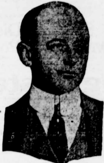
James W. Wadsworth, Jr., Senator from New York, who is the youngest member of the United States Senate.