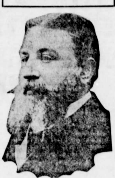
M. Radoslavoff, premier of Bulgaria, whose negotiations with the belligerents has caused much speculation as to which side Bulgaria would favor.