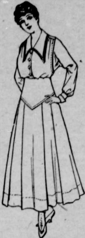
An Attractive Costume Featuring the Deep Armhole and Yoke Skirt McCall Patterns Nos. 6705-6685, two of the many new designs for September.