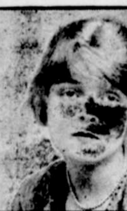
Mae Marsh, the coming of America