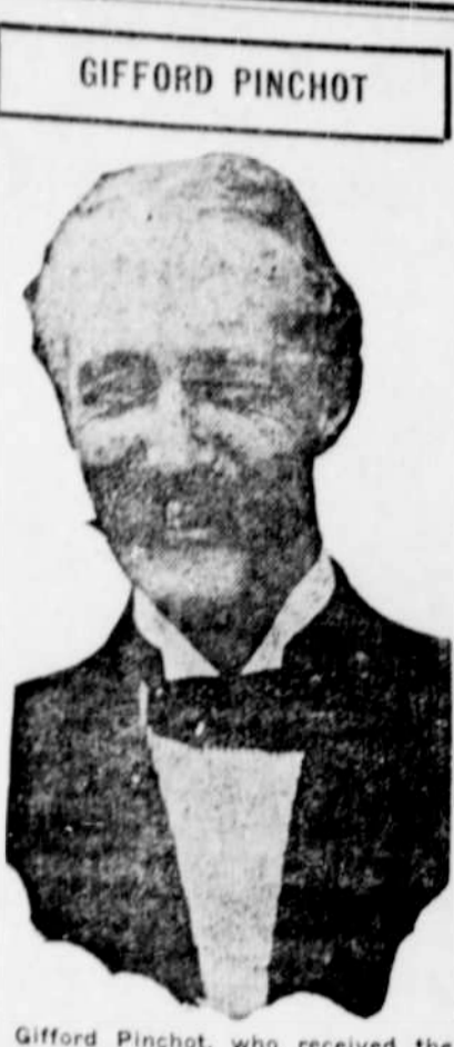
Gifford Pinchot, who received the Progressive nomination for United States Senator from Pennsylvania at the primaries.

WILL SELECT SUFFRAGE BILL Meeting Called to Concentrate Support for Measure Before Congress. Washington.—In an effort to concentrate support for a suffrage measure in congress, suffrage leaders issued a call for a meeting of all leaders in the movement in the United States at O. H. P. Belmont's Newport home, Marble House, July 3. Two bills, one by Senator Shafroth and the other by Senator Bristow, are before congress. The suffrage leaders are divided as to which measure is better, but they hope to settle all difficulties at the meeting. Suffrage workers from nearly all states, and representatives of the congressional union and the national American woman suffrage association will participate. Metcalf to Make Race. Omaha.—Richard L. Metcalf, vice-chairman of the committee to arrange the formal opening of the Panama canal, has decided to accept the petition filed in his behalf for the democratic nomination for governor of the state of Nebraska.