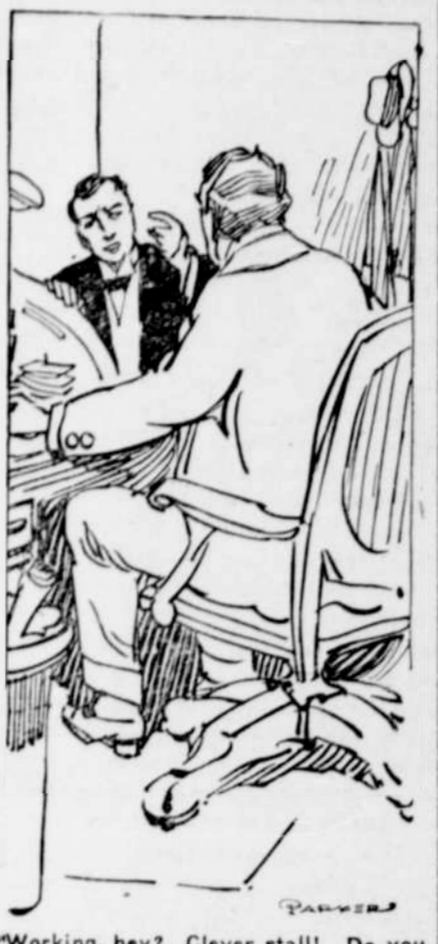
"Working, hey? Clever stall! Do you see that?"

"Excuse me. Anthony saw Runnels searching the room with anxiety. He hurried toward him and inquired, breathlessly: "Have you got him?" "Sure, I showed him your room. He'll be on the job. Has she come?" Kirk shook his head. "Gee! I'm nervous." He wiped his brow with a shaking hand.