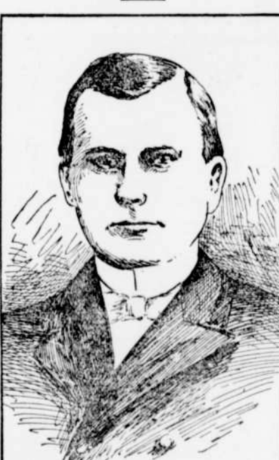
WILBUR GLENN VOLIVA.

Wilbur Glenn Voliva, overseer of Zion City, Ill., who was taken to jail because of his refusal to allow payment of a judgment for $10,000 obtained against him by an attorney of Zion City, because of articles written by Voliva two years ago, became connected with the work of the late John Alexander Dowle at the beginning of Dowle's work in Chicago. In 1906, a year before Dowle's death, he was named deputy general overseer of all the affairs of Zion throughout the world, and he succeeded to leadership in 1907. Mr. Voliva was born in 1877 near Newton, Ind. After graduation from Union Christian and Hiram colleges he entered the ministry in the Christian church and held pastorates in several States. He is a fluent speaker.