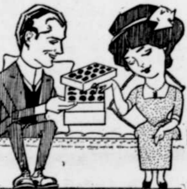
Headquarters for Candy and Cigars WEATHERLY CONFECTIONERY.