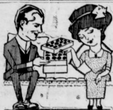
Headquarters for Candy and Cigars WEATHERLY CONFECTIONERY.