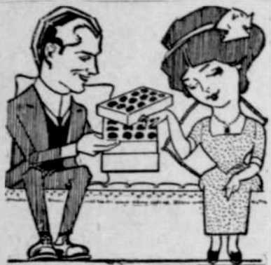
Headquarters for Candy and Cigar WEATHERLY CONFECTIONERY.