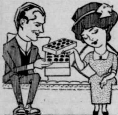
Headquarters for Candy and Cigars. WEATHERLY CONFECTIONERY.