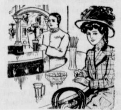
Get an Electric mixed milk drink Ellis', it tastes differnt.