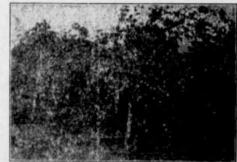
ORCHARDS ARE NUMEROUS AND PROFITABLE

The city now has a large planing mill, bank, department store, four general stores, two real estate firms, one hardware store, one furniture store, one drug store, one jewelry store, one meat market, one bakery, two confectionery stores, one blacksmith shop, two barber shops, two men's furnishing goods stores, two hotels, one box-ball alley, one photograph gallery, one millinery store, one newspaper, one second-hand store, one livery stable, one public hall, one motion picture show, two