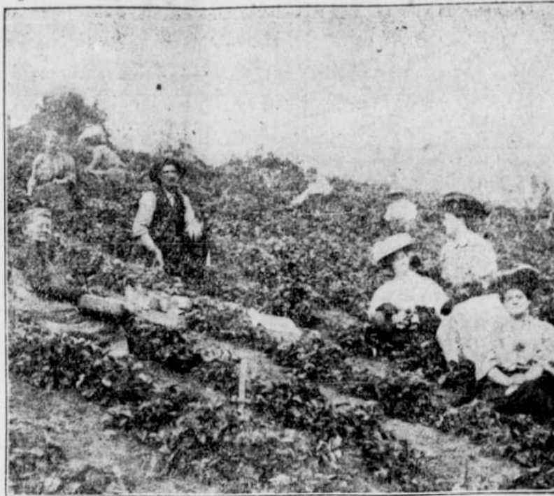
FALLS CITY STRAWBERRY CROPS ARE PROLIFIC AND PROFITABLE

The city derives its name from the falls of the Luckiamute River. The falls are inside the city limits—only two blocks from the main business part of the city—and furnish a never-ceasing natural wonder that is the pride of the citizens and is an attraction to visitors.