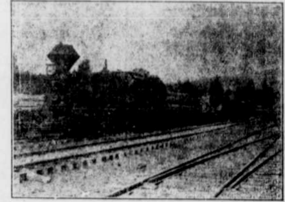
TRAIN-LOAD OF LOGS ON THE S., F. C. & W. RY.

The lumber and logging business has been the principal industry of this section from the beginning, 22 years ago, and it will continue to