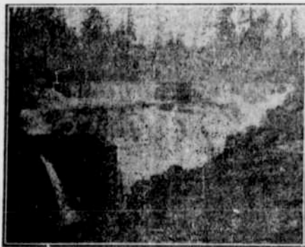
LUCKIAMUTE FALLS, IN FALLS CITY

There are Dramatic, Musical and Social organizations, Commercial Club, Base Ball clubs, free reading room, motion picture shows, halls for dances, entertainments, public and lodge meetings.