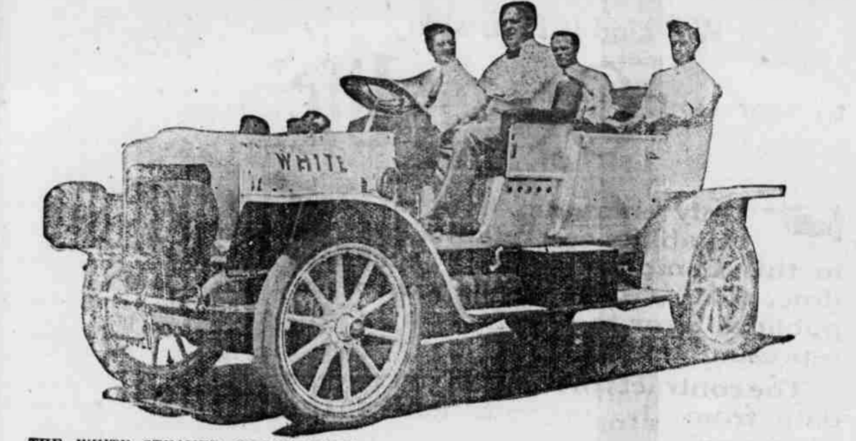
THE WHITE STEAMER WHICH MADE A SUCCESSFUL PUBLIC DEMONSTRATION OF KEROSENE AS FUEL ON THE RECENT 2650-MILE GLIDDEN TOUR.

The most interesting announcement ever made in connection with the automobile industry was undoubtedly that made a month or two ago to the effect that the new models of the White Steam Cars could be run on kerosene, or coal oil, instead of gasoline. Everyone at once recognized that the use of the new fuel would add materially to the advantages which the White already possessed over other types of cars. There were some people, however, who were sceptical as to whether or not the new fuel could be used with complete success and, therefore, the makers of the White Car, the White Company, of Cleveland, Ohio, determined to make a public demonstration of the new fuel in the 1909 Glidden Tour.