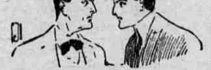
"I'll make you pay for that!"

"I didn't know you were that kind, Haines," said Norton, his virtue