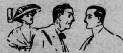
"You can't refuse to believe Miss Langdon."

Don't forget there's some money coming in soon! "You told father that?" gasped Carolina. Norton nodded. "I don't understand it," said Langdon. "To think that he was that kind!" Son Randolph now took his turn in the case against the secretary. "We were both here, father. I heard him—Carolina heard him," he said. "Didn't you, Carolina?" "Yes," said the girl weakly, "I was here." Then she turned abruptly. "I must go," she said. "Must go right away. Mrs. Holcomb is waiting for me." The senator turned to his desk bent and discouraged.