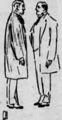
"Better see Senator Langdon."