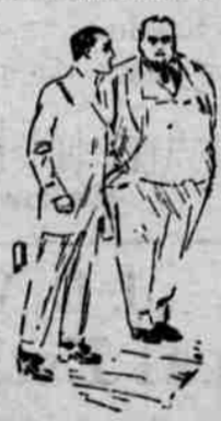
"It's a trick," said Haines.