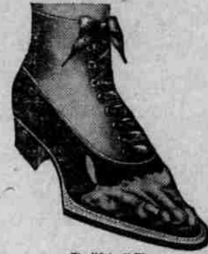
The "Other" Way

A word about "Natural Shape" lasts — You don't relish the idea of crowding your foot into a shoe. It isn't necessary.