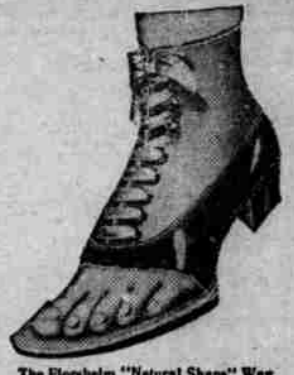
The Florsheim "Natural Shape" Way