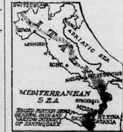
HARBOR OF MESSINA AND MAP SHOWING REGION AFFECTED BY RECENT SEISMIC DISTURBANCE.