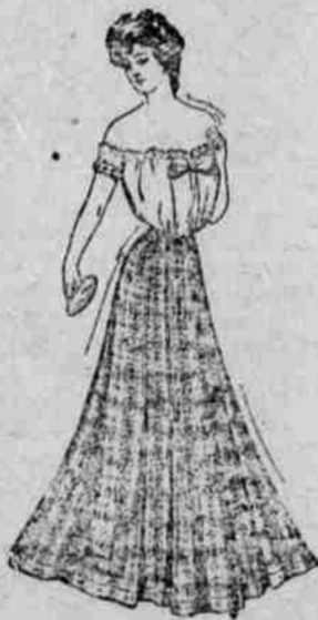
From $2.50 up.