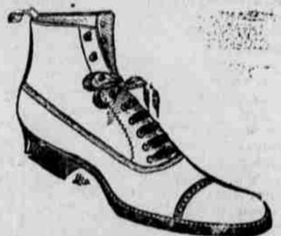
Gold Seal Overshoes and Rubbers--absolutely the best.

PERFECT IN STYLE AND FIT OUTWEAR ALL OTHERS