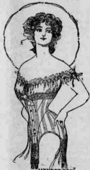
Prices $1.75 up.