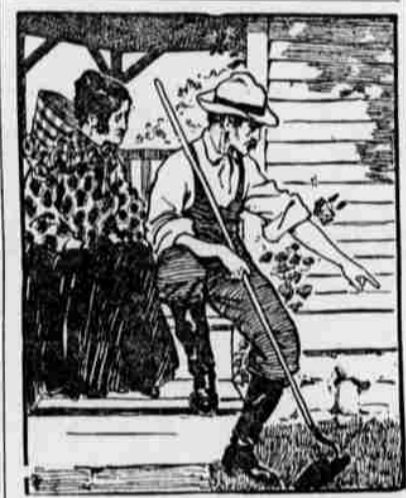
"THIS HERE ONION BED'S MINE."

worker an' that careful of his clothes, why, I mended more for one of my own children in a week than I did for him in two months.