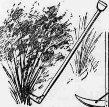
TOOL FOR BERRY GROWER.

Handy Home-Made Tool. All growers of blackberries and raspberries know that one of the most disagreeable jobs of the season is the cutting out of the old canes on the plants of these fields.