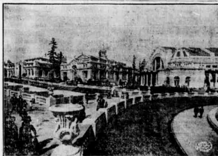
PANSIES AND POSIES EVERYWHERE AT A.-Y.-P. EXPOSITION.

In constructing its group of five buildings, the United States Government had regard for the type of architecture followed generally in the buildings of the Exposition proper. The Exposition structures are in the modern French renaissance and the Government in the modern Spanish. The two styles tie in nicely together and make an harmonious whole. On the right of the picture is the Alaska building, one of the Government group. In the center is the European Exhibits Palace. On the left is a facade of the Palace of Agriculture. The last two named are in the French renaissance and were completed before December 1, 1908. The Alaska building was completed April 15.