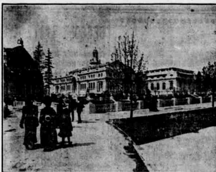
SCENE ON THE COURT OF HONOR, A.-Y.-P. EXPOSITION, SEATTLE.