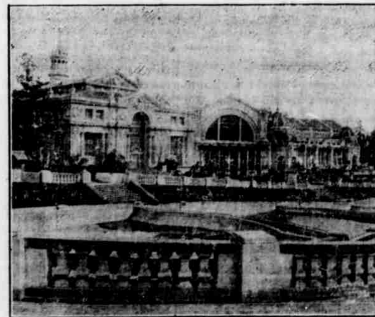
ORIENTAL PALACE AND MANUFACTURERS BUILDING.

The building is absolutely fireproof. It is of reinforced concrete and brick and, at the end of the Exposition, it will revert to the University of Washington, by which it will be used as a School of Chemistry.