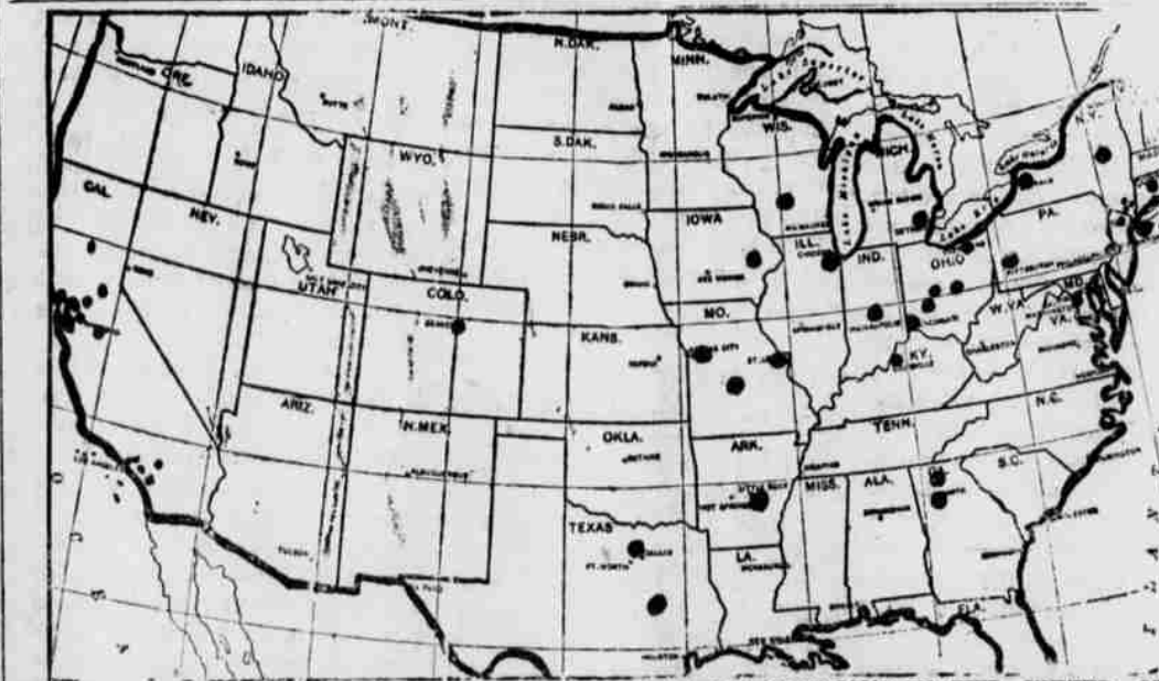
THIS MAP SHOWS THE PRINCIPAL RADIO BROADCASTING STATIONS IN THE UNITED STATES.

Before attempting to receive, it will be necessary to test the piece of galena in order to find the most sensitive spot and for this purpose we will need a buzzer test.