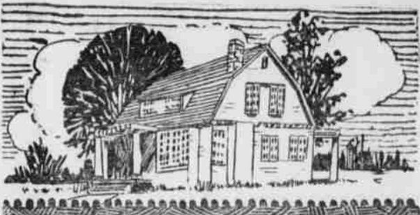
A REAL STOCK AND GRAIN FARM

Owing to the bad weather yesterday the festivities incident to starting drilling for oil in Fern's valley were postponed for another week. A good-sized crowd from various points in the valley gathered at the derrick in the afternoon, and in order not to disappoint these drilling was started. The real christening ceremonies will not take place until next Sunday, however. Everything worked smoothly, and drilling will continue right along now.