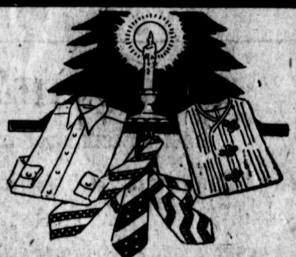
Shirts, Ties, Pajamas That Will Please Him