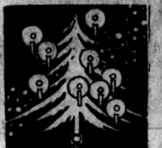
Make the Most of Christmas Joy