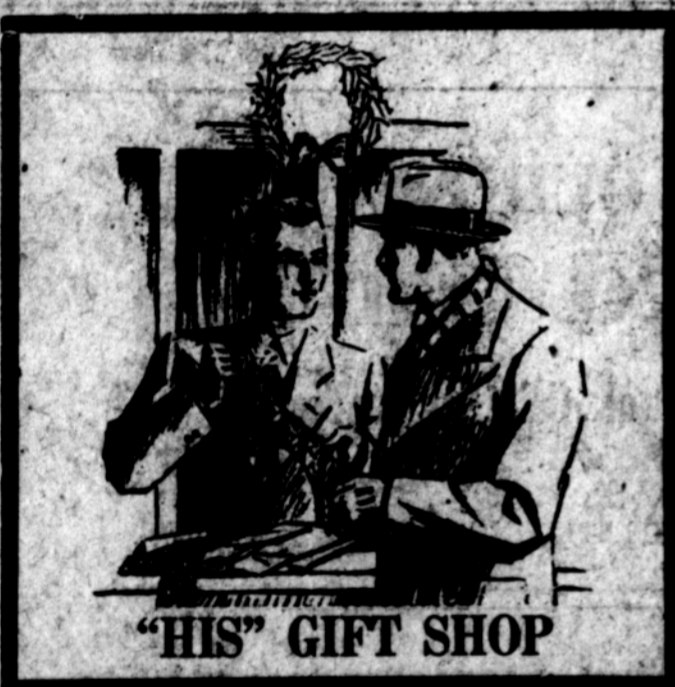
"HIS" GIFT SHOP