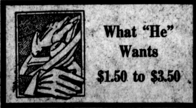
What "He" Wants $1.50 to $3.50