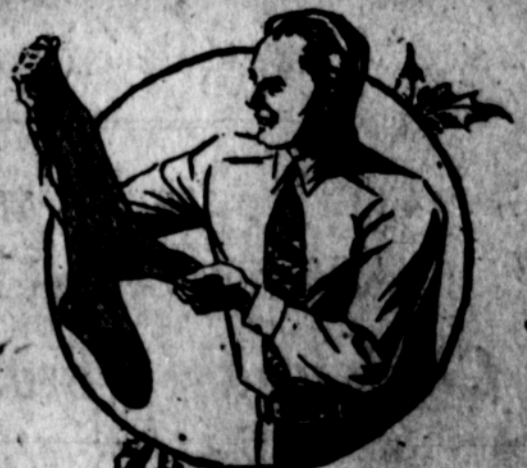
Original Cooper's Hosiery Snappy Patterns 25c to $1.25 Pair