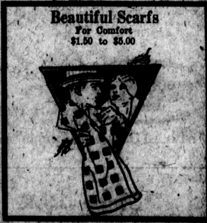
Beautiful Scarfs For Comfort $1.50 to $5.00