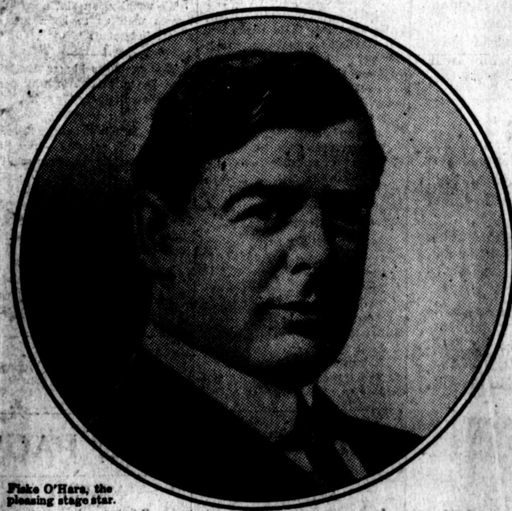
Fiske O'Hara, the pleasing stage star.

If you offered Fiske O'Hara a cigarette—other than a Lucky Strike, he'd say to you: