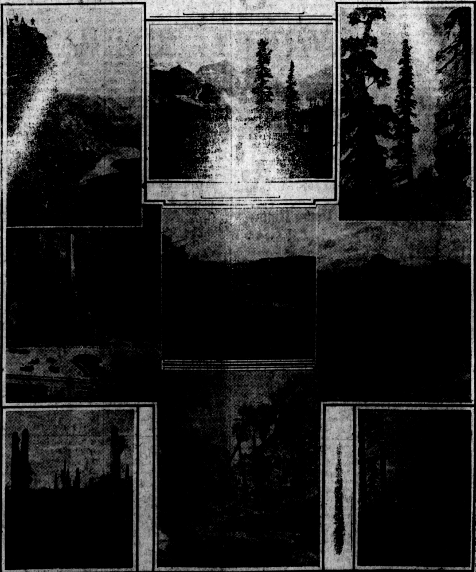
Reading left to right, top row—Glacier National Park; In the Canadian Rockies; Trail in Glacier National Park. Middle row—Maitnomah Falls, Columbia Highway, near Portland; In the Lake Country, near Spokane; Mt. Rainier, Oregon. Bottom row—In Arizona; Palm Springs, California; Chuckanut Drive, Washington.