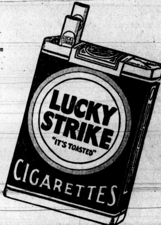
When in New York you are cordially invited to see how Lucky Strikes are made at our exhibit, corner Broadway and 45th Street.