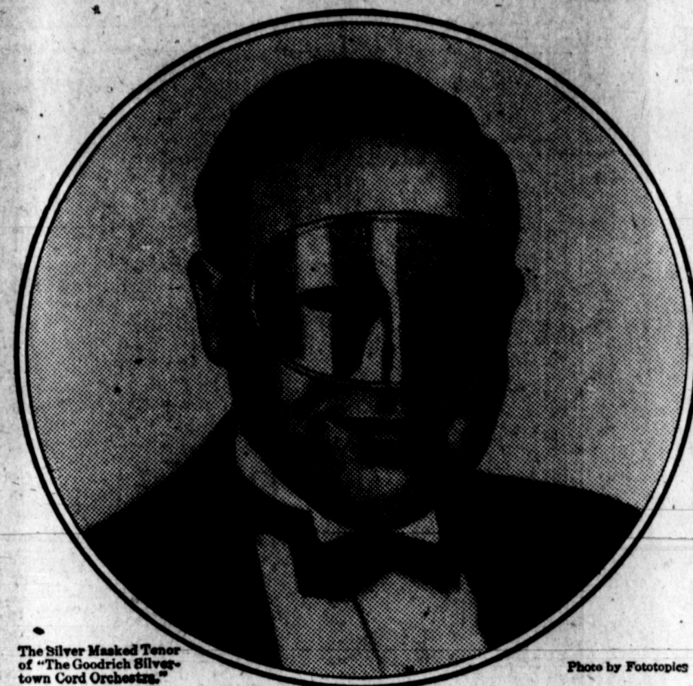
The Silver Masked Tenor of "The Goodrich Silvers" town's Cord Orchestra.