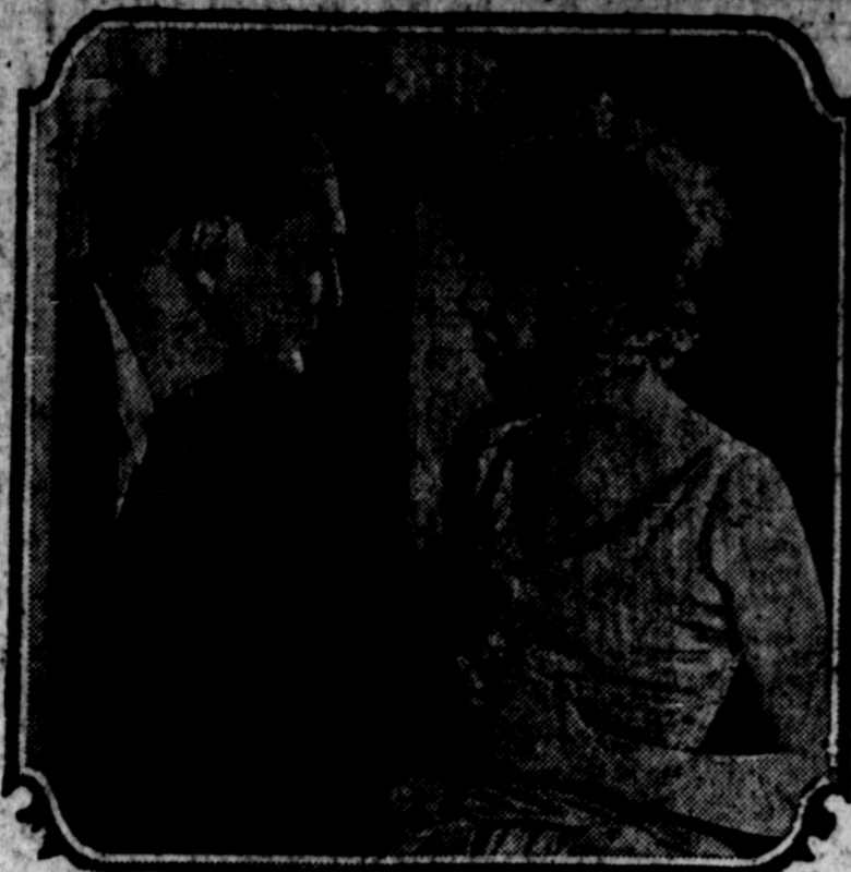
Richard Dix and Mary Brian in the Malcolm's, a Clair Production, 'Knockout Kelly' A. Paramount Picture