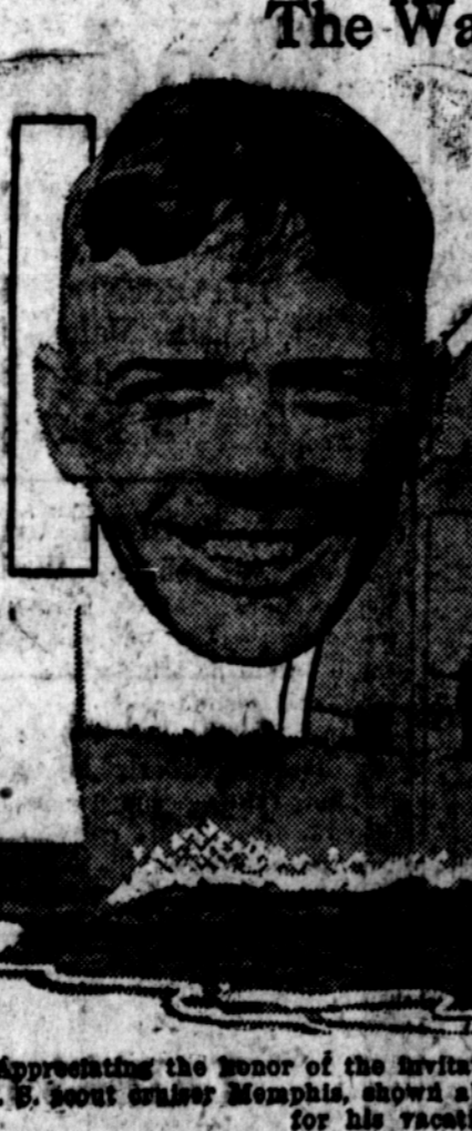
"Representing the honor of the invitation and accepting," Captain Charles A. Lindbergh will arrive in Washington June 11 aboard the U. S. post ship Memphis, shown above. He will be the guest of President Coolidge for two days before the president's departure for his vacation in the Black Hills. The inset gives a closeup of the famous Lindbergh smile.