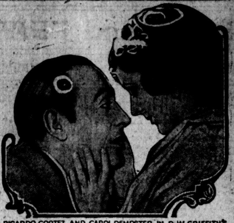
RICARDO CORTEZ AND CAROL DEMPSTER IN D. W. GRIFFITH'S "SORROWS OF SATAN" A PARAMOUNT PICTURE