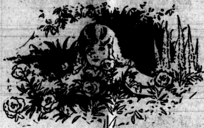
He hid her behind a big clump of Pinks.

Then the black-eyed boy and the blue-eyed girl laughed and laughed and laughed because they had such a very good joke on the people who had not cared enough about a