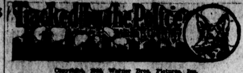
TRACKED BY THE POLICE starring Rin-Tin-Tin, is a Warner Bros. production of this novel.