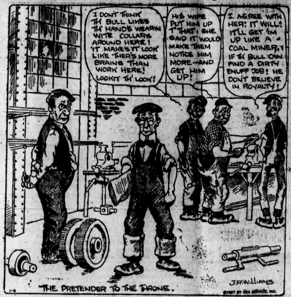
THE PRETENDER TO THE THRONE.