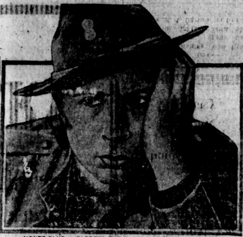
MONTE BLUE IN "ACROSS THE PACIFIC" A WARNER PICTURE