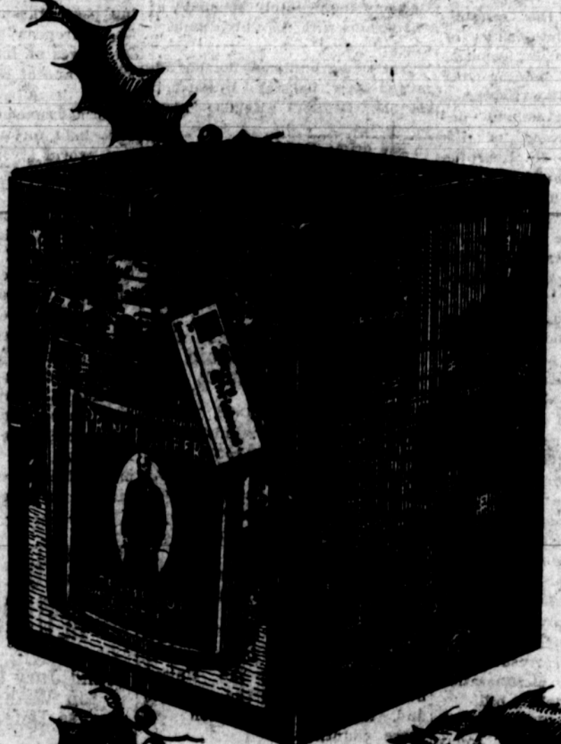
P. A. is sold everywhere in 1 1/2 oz. tins, pound and half-pound tins, and pound crystal-glass humidors with sponge-moistener top. And always with every bit of bite and punch reserved by the Prince Albert process.

This prime favorite of experienced smokers also comes in pound and half-pound tins. At the nearest shop, you will find Prince Albert in sizes to suit every purse and purpose. If he smokes a pipe, your Christmas problem is settled . . . and settled satisfactorily.