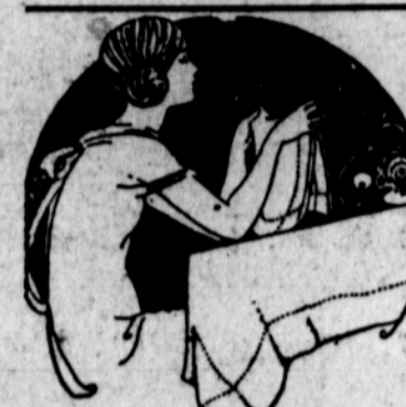
TABLE LINENS REDUCED

For This Special Event We Offer Special Values in Every Section Of The Store.