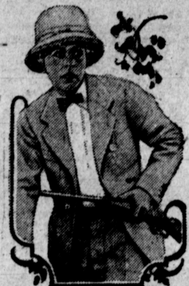
Douglas MacLean in the Paramount Picture "Hold That Lion"