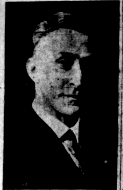
SENATOR GEORGE DUNN State Senator