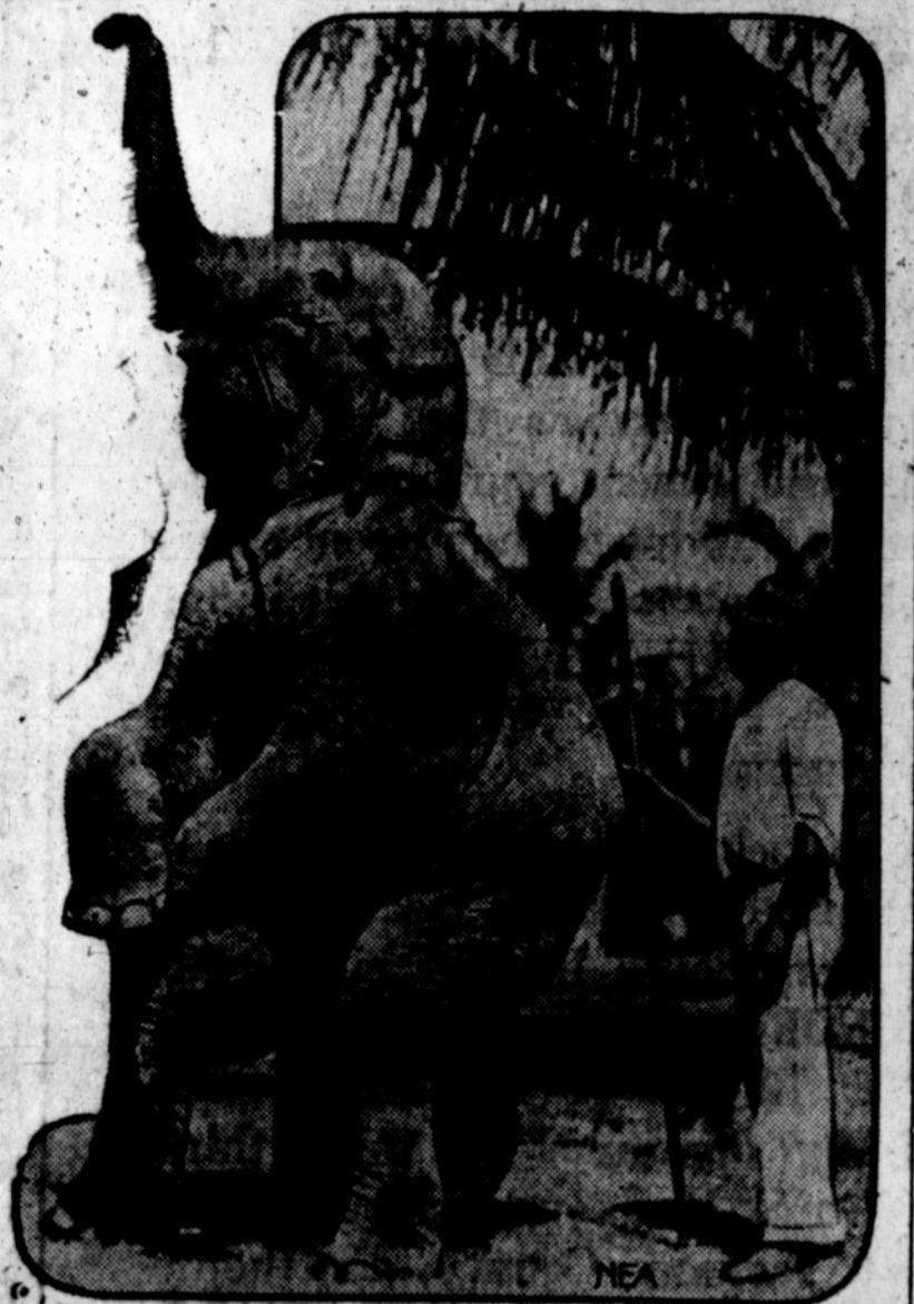
Rose, pet elephant at Miami Beach, Fla., rests up and takes a good smoke after her toil. And why shouldn't she? She's just finished pushing 45 palm trees back to an upright position in the course of her work on a hurricane reconstruction job.