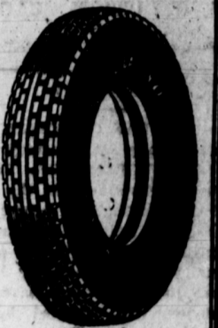
United States ROYAL CORD Balloon The tire that makes its own good roads. Maximum strength and maximum flexibility in the carcass by the use of Latex-treated Web Cord. Every cord under uniform tension through the Flat Band method of construction. Handsome, effective tread providing sure traction, positive braking and protection against skidding.

Latex-treated Web Cord means new comfort, new economy and new freedom from worry. And when the pavements are slippery and you step on the brake, you'll know that you're boss.