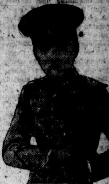
MARION DAVIES BEVERLY OF GRAUSTARK

FOR SALE - My $600 equity in 6 room house for car, or what have you. 2 lots close in. Deakin, 175 East Main. 24-2*