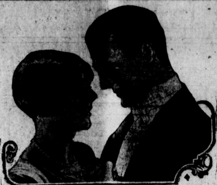
Blanche Sweet and Neil Hamilton in the Marshall Neilan Production "Diplomacy" A Paramount Picture

through vacation season. We can welcome you to a well-graded Sabbath school, specializing in Bible instruction. Preaching, 11 a. m. by the pastor. Subject: "The Weeping Prophet." B. Y. P. U. Quiet Hour at 6:15. Helpful program at 8:30. Preaching, 7:30. An evangelistic and inspirational service. We aim to be duly mindful of starting and closing on time. Special: Our Rally and Home Coming Day was one of finest