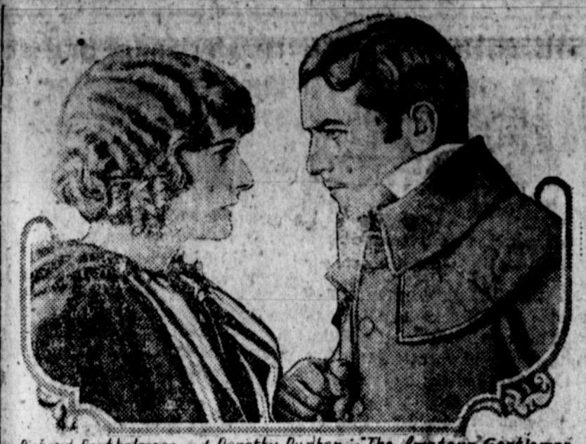
Richard Barthelmess and Dorothy Dunbar in 'The Amateur Gentleman'